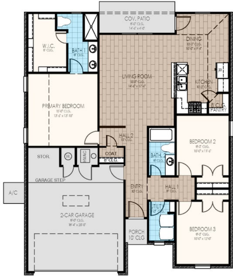
Elevation A & C