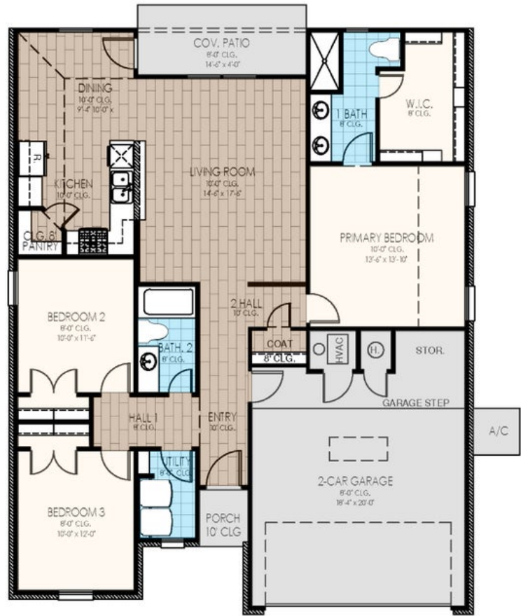
Elevation A & C

Floor Plan: Bradford Square Feet: 1,416 (m.o.l.) Bedrooms: 3 Bathrooms: 2.0 Garage: 2 Car