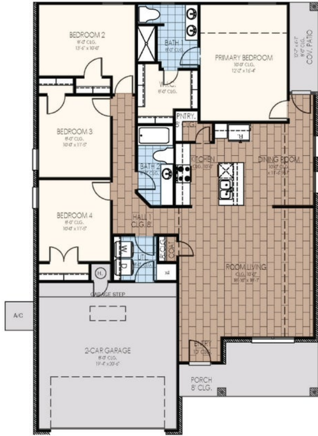
Elevation B & C

Floor Plan: Redwood Square Feet: 1,702 (m.o.l.) Bedrooms: 4 Bathrooms: 2.0 Garage: 2 Car