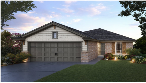
□ Elevation C

Square Feet: 1,301 (m.o.l.) Bedrooms: 3 Bathrooms: 2.0 Garage: 2 Car