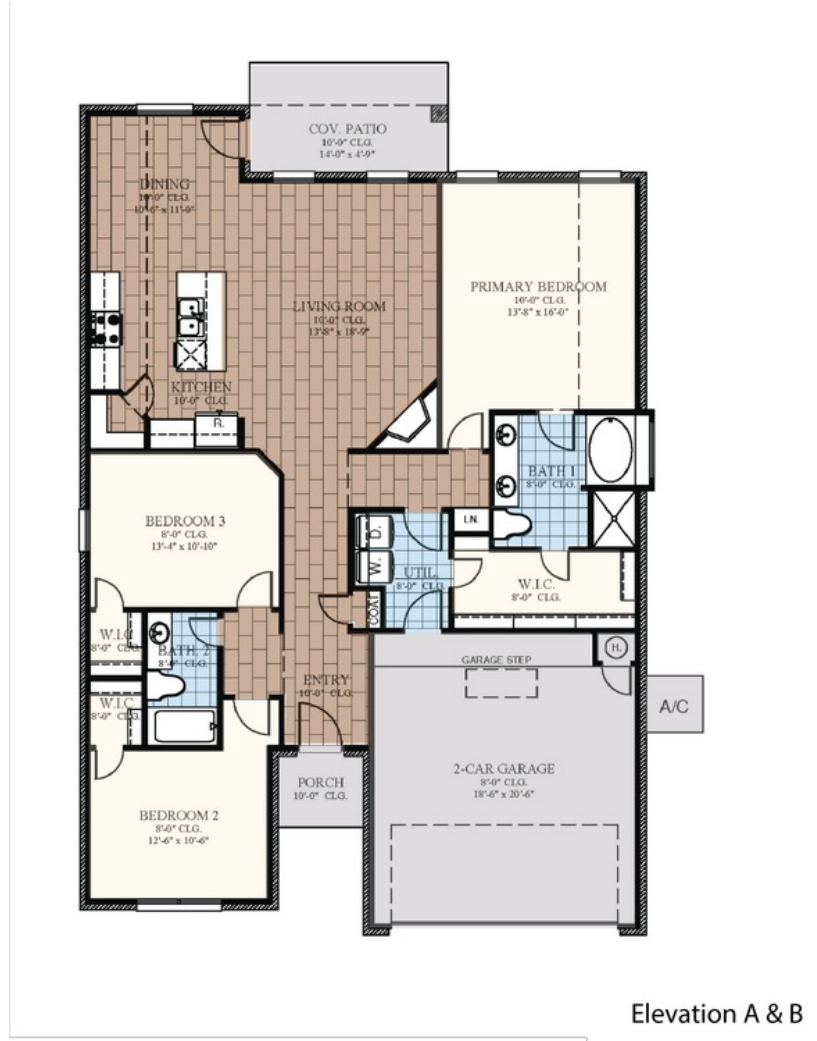
Elevation A & B