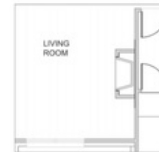
ADD CENTERED FIREPLACE